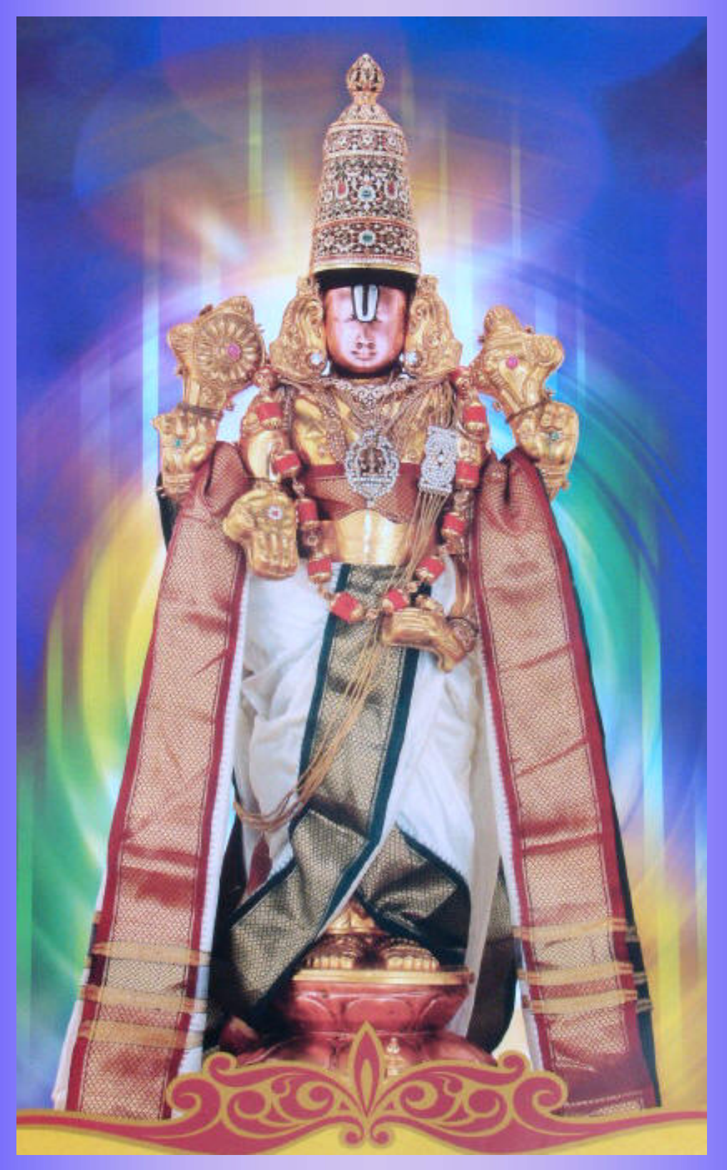
Ninna nodi dhanyanaadenoh hey srinivasa!