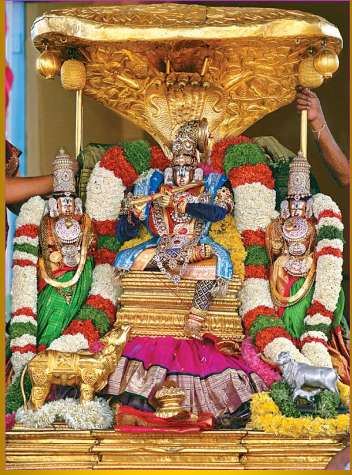
Oh Srinivasa Please do not abandon me