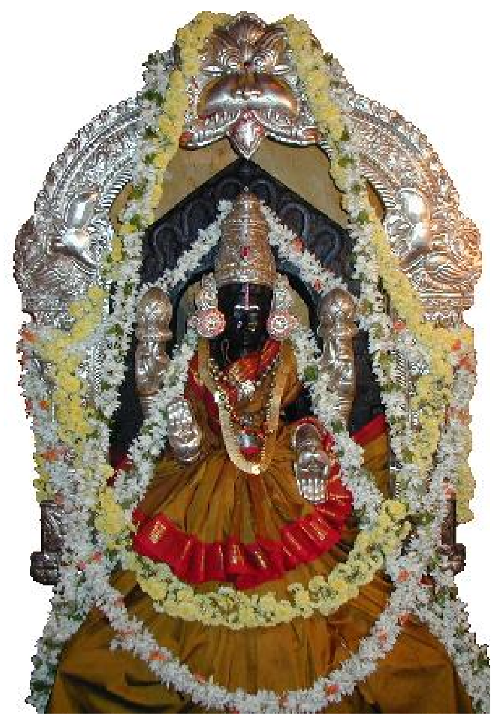
ahObilavalli - Chenchulakshmi thAyAr - ahobilam