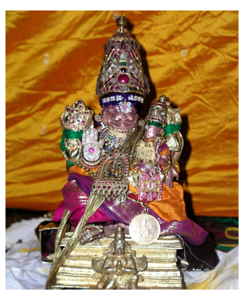
Sundara simham – ahobila mutt